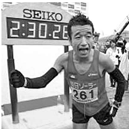
Neko the Clown – no laughing matter 10 – The Pace Setter

Japanese comedian Hiroshi Neko has made the Olympic Marathon team. But not Japan's. His marathon PR of 2:30:36 would hardly qualify him for the Japanese team or any other except the Cambodian team. Neko had to become a Cambodian citizen to be eligible. Now he can toe the line with the world's best and joke about it.