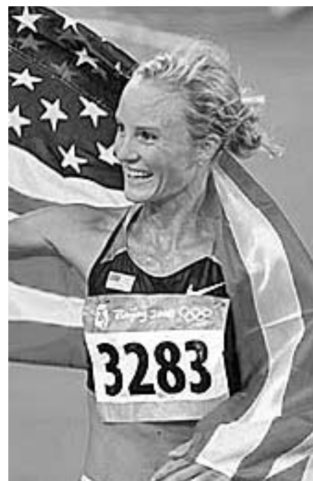
Shalene Flanagan: New American queen of Distance Running – Aiming for London gold